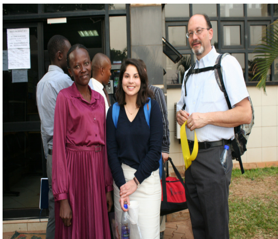
ED/Founder SAU and delegates from Cincinnati Children's Hospital USA.